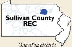
One of 14 electric cooperatives serving Pennsylvania and New Jersey

Sullivan County REC P.O. Box 65 Forksville, PA 18616 570/924-3381 1-800-570-5081 Email: screc@epix.net Website: www.screc.com