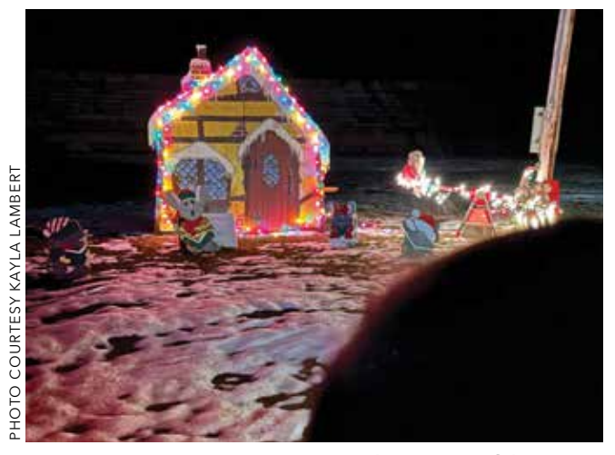
DIFFERENT DISPLAYS: Visitors are treated to creative holiday displays at the fairgrounds in Forksville. This is the first year for the Great Light Fight, part of the 2022 Christmas Village.

yes, there was heat inside. In years past, there have been upward of 25 vendors selling a little bit of everything, which offered community members a great way to support local small businesses and start their Christmas shopping.