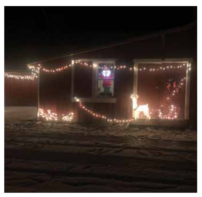
TRANSFORMATION: Members of the community transform the Sullivan County Fairgrounds into a winter wonderland.

Anything is possible at Christmas, so who knows: Maybe Forksville will be the next site of a Hallmark movie! •