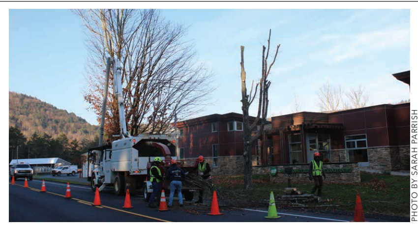
WE'RE IN THE SAME BOAT: Spako's Tree Service removes two maple trees from the front yard of Sullivan County Rural Electric Cooperative along Route 87 in November. Just like our members, the co-op sometimes needs trees removed on its property in Forksville for the safety of our employees, members, and the community. While we're sad to see them go, we all understand it was for everyone's safety. We ask our members to keep this in mind when trees need to be removed or trimmed on their property near our electric lines.

We couldn't say it better ourselves! At a small co-op, it's all hands on deck, and co-workers willing to lend a helping hand are greatly appreciated. •