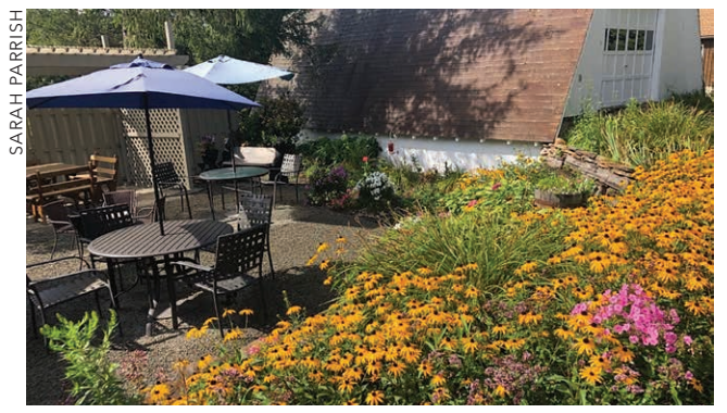
GARDEN CAFE: Sit down and enjoy your ice cream in the garden cafe at Baumunk's General Store. Their lush gardens are the perfect place to relax on a summer day.

Besides ice cream, they also offer an extensive menu, featuring all-day breakfast, lunch and dinner options, plus their famous Baumunk's General Store old-fashioned sodas. They also have Shunk merchandise, fishing and