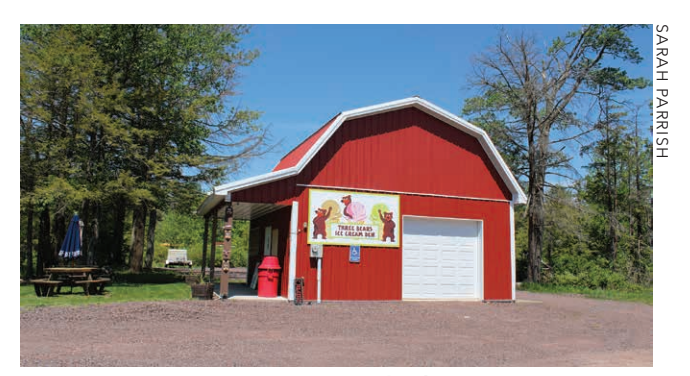
LEIBY'S ICE CREAM: Have you ever had Leiby's ice cream? No? Neither have we! Stop by Three Bears Ice Cream Den outside of Laporte to try it.