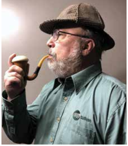
FAMOUS CHARACTER: Although there have been many famous detectives written about and depicted in plays, television shows and movies, one of the most well-known and loved characters of all times is Mr. Sherlock Holmes of 221B. Baker Street.

wasn't looking for any particular items, but I kept an eye out for more unusual pieces. Over time, I picked up everything from a Sherlock Holmes cigarette card, Holmes teapot, pipes, books, VCR tapes, and DVDs, to "Star Trek The Next Generation" figures of Lt. Data as Holmes and Geordi LaForge as Watson.