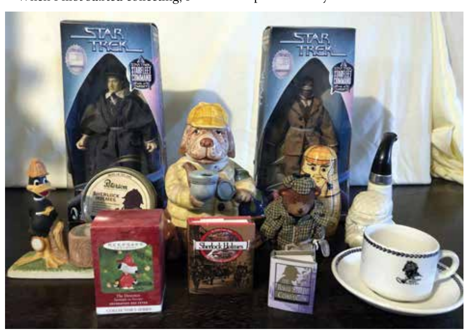
PART OF THE COLLECTION: The list of items I have collected relating to Sherlock Holmes is large and varied. Here are just a few of the items in my Sherlock Holmes collection.

If you like a good mystery I'd suggest picking up one of the Sherlock Holmes books written by Doyle. But be careful — you may find yourself lost in a back street of London with fog so thick you can barely see your hand in front of your face. Dark shadows of indistinct figures pass by you. But rest assured, you'll know things are well in hand when the quiet of the street is broken by Holmes exclaiming, "The game is afoot!"