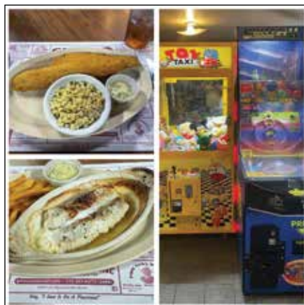
FOOD AND FUN: Fabulous food and fun are available at the Forksville Inn & Tavern, where there is a wide range of food items from hamburgers to black diamond steaks and their ever-popular fish dishes.

Like many other restaurant/bar businesses, the Forksville Inn & Tavern offers a wide range of entertainment to provide their customers with more than simply a delicious meal. They have had bands, Super Bowl parties, a Halloween hayride, and the list goes